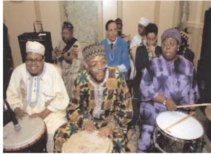
Members of the Arts and Drama Institute, Inc. of Washington, DC, perform at this year's Board Retreat. drama therapies.

The evening kicked off with a thrilling choral presentation by The Art and Drama Institute (ADTI) Choir, accompanied by The Moroccan Ensemble. ADTI, located in Northeast Washington, DC, is known for its innovative approach to the care and treatment of adults with mental retardation through the use of art, music, movement and