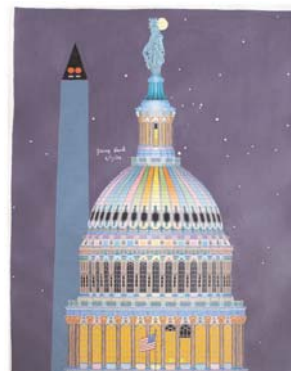
"The Capitol Dome"